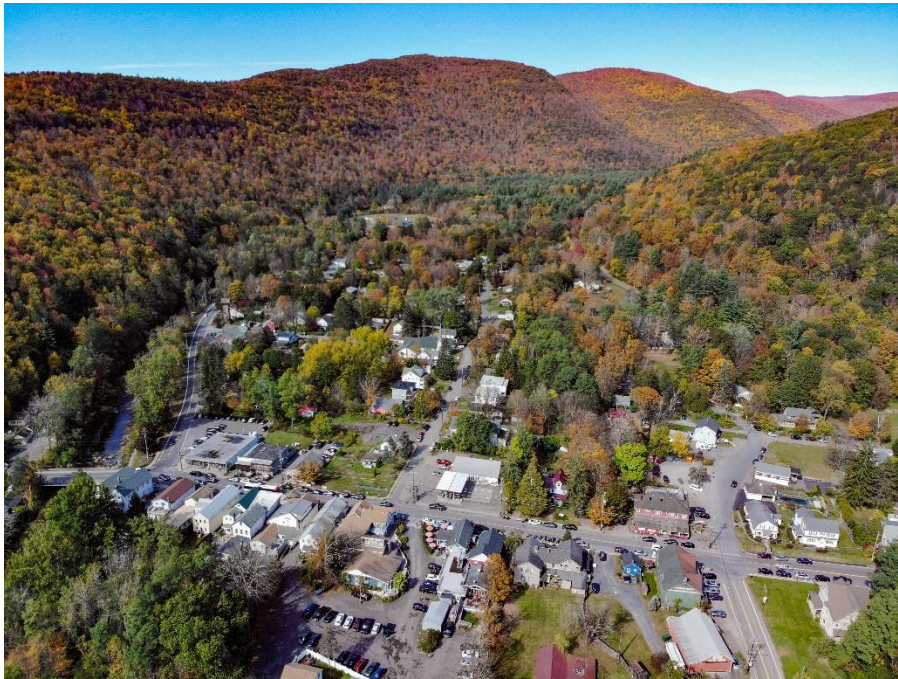
Phoenicia Drone

This is an update of the Original 2010 Mid-Hudson Regional Greenhouse Gas Emissions Inventory Final Report. 1